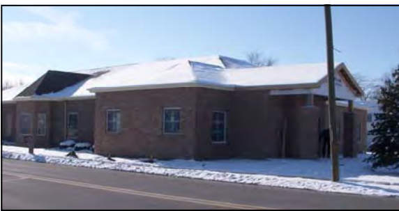
New front entry to the Ossian Branch—it will face the north parking lot. * See next page to find out how to like us on Facebook to get updates about the library and view more photos of the construction.

The project will then move into phase two, which contains the removal of existing walls and the construction of a programming room in the children's room. This phase also includes reorganization of the existing space, painting, and new carpeting. Phase two should last approximately six to eight weeks. During this time, Ossian patrons