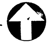
LIGHTING PLAN SCALE: 1/8"=1'-0"

SHEET TITLE : LIGHTING PLAN PROJECT NO. 88-1207 REVISIONS : DATE : 6-20-90 SHEET NO. E-1