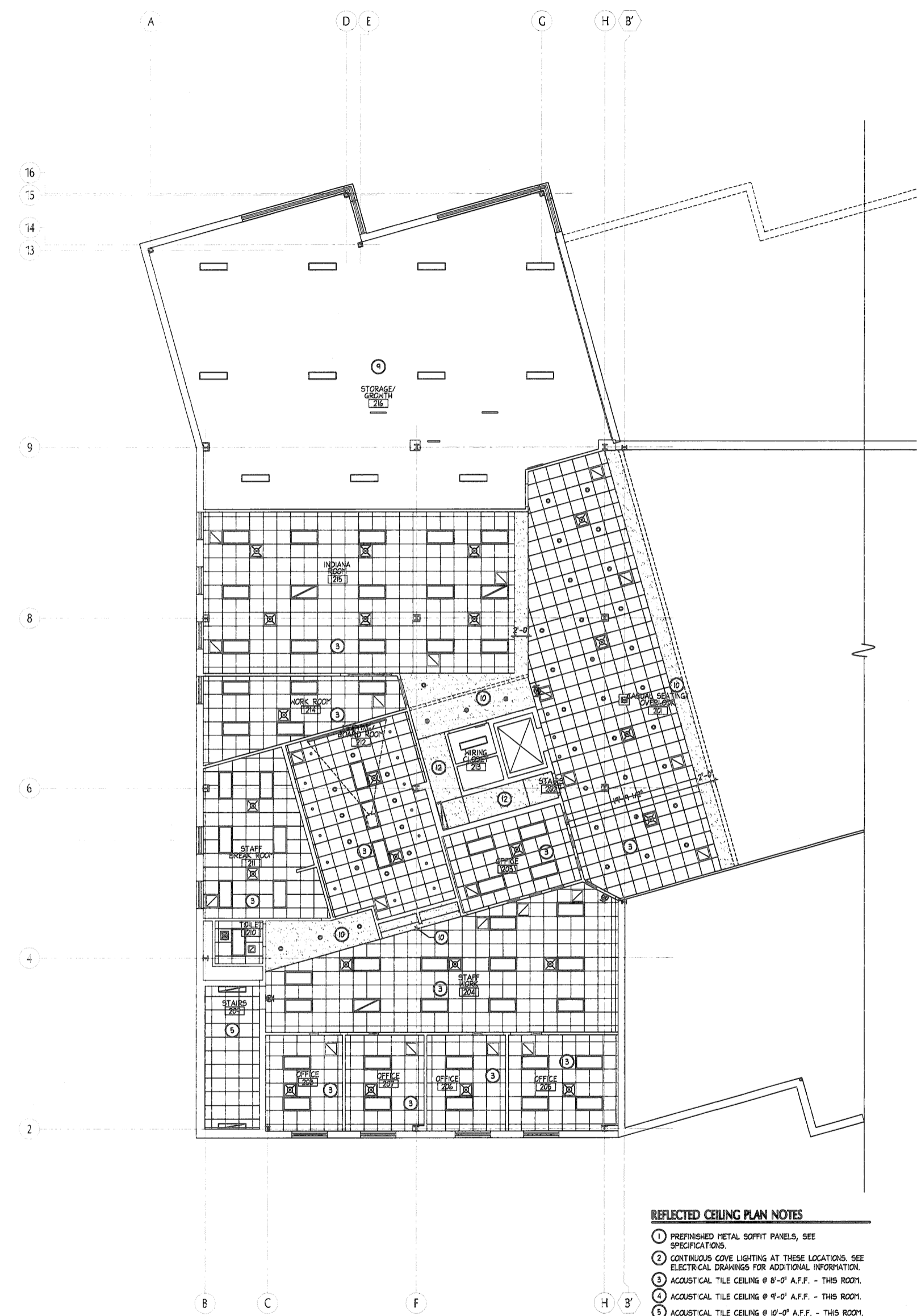
SECOND FLOOR REFLECTED CEILING PLAN SCALE: 1/8" = 1'-0" NORTH