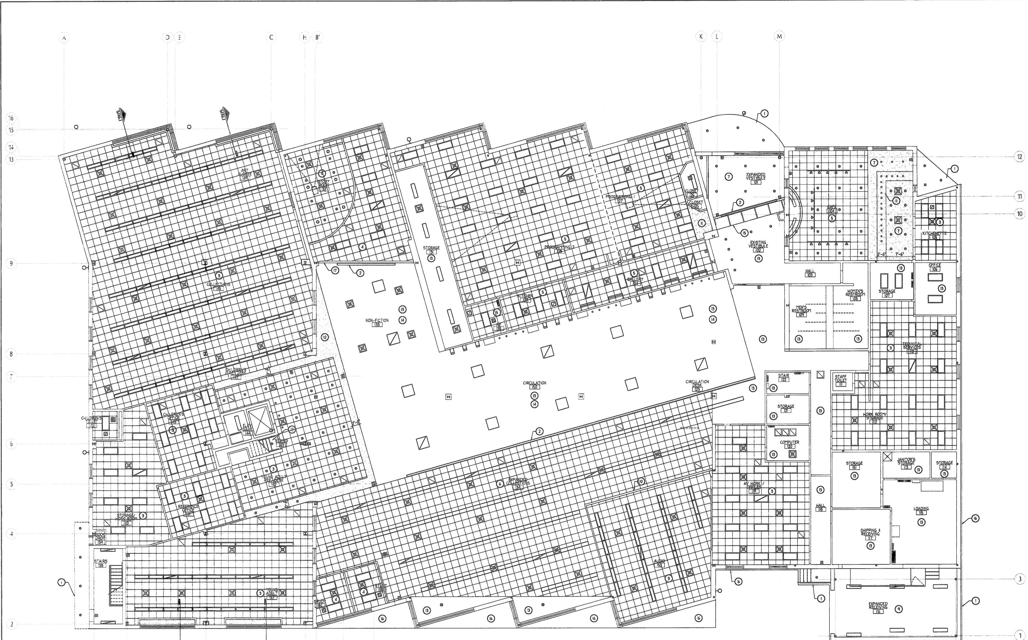
FIRST FLOOR REFLECTED CEILING PLAN SCALE: 1/8" = 1'-0" NORTH