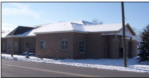
New front entry to the Ossian Branch—it will face the north parking lot. * See next page to find out how to like us on Facebook to get updates about the library and view more photos of the construction.

The project will then move into phase two, which contains the removal of existing walls and the construction of a programming room in the children's room. This phase also includes reorganization of the existing space, painting, and new carpeting. Phase two should last approximately six to eight weeks. During this time, Ossian patrons