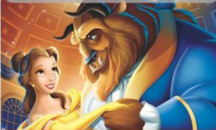
Beauty & the Beast Saturday, Jan. 12, 2:00 - Rated G.