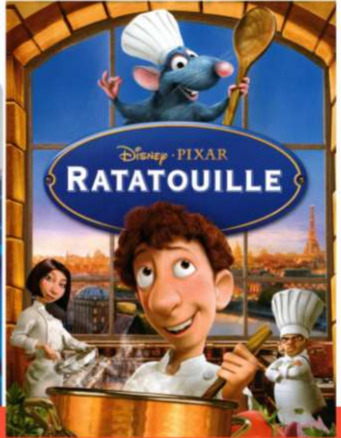
Ratatouille Saturday, Feb. 23, 2:00 - Rated G.